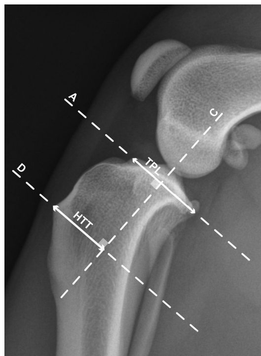
FIGURE 2 Measurement of the ratio horizontal tibial tuberosity distance to tibial plateau length (HTT:TPL). Measurement of the caudocranial relative position of the insertion of the patellar tendon on the tuberosity of the tibial crest on a mediolateral radiograph. A. Dashed line drawn through the tibial plateau; tibial plateau length (TPL) measured from the most cranial to the most caudal point; C. dashed line drawn through the center of the tibial intercondylar eminences and perpendicular to the line A; D. dashed line through the distal insertion of the patellar tendon on the tuberosity perpendicular to line C; horizontal tibial tuberosity (HTT) distance measuring from the distal insertion of the patellar tendon on the tuberosity to line C

An unpaired t-test was used to compare the measured VTT:TPL, HTT:TPL, and PLL:PL ratios, and TPA