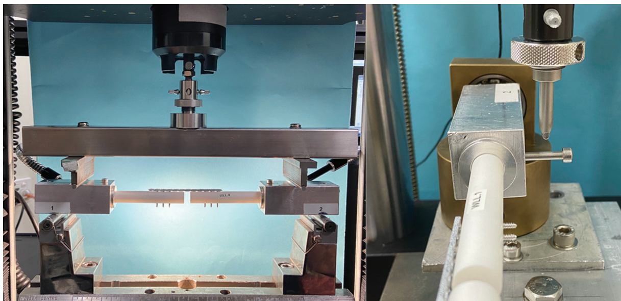
Fig. 2 Biomechanical testing setup for four-point compression bending (left) and torsion (right).

All data from the material testing were measured at a rate of 10 Hz. All constructs underwent three loading cycles in each direction of testing (compression bending and torsion). As per previously published protocols, 2,3,8 the load displacement measurements were recorded from the third cycle of