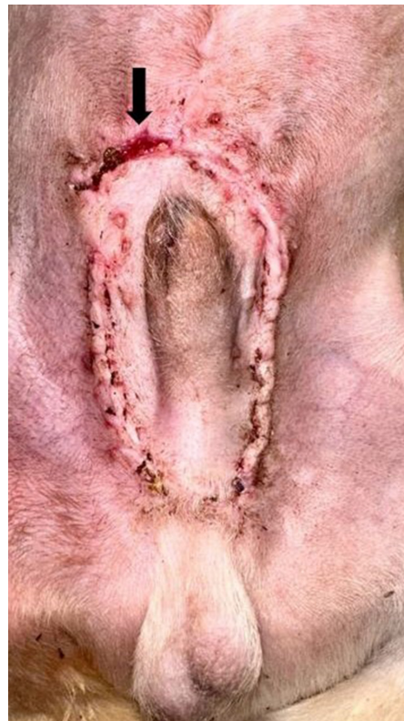
FIG 3. (Dog 4) A 1.5 cm dehiscence was observed on the cranial right side of the inverted U-shaped incision (arrow). The dehiscence was left to heal by second intention

Cranial advancement of the prepuce has been shown to successfully cover the exposed penis in four dogs with idiopathic paraphimosis with an exposure <1.5 cm (Papazoglou, 2001). In this study, recurrence was detected in two dogs that had an increased length of penile exposure (2.2 and 2.4 cm, respectively). Recurrence was noted in dogs: one with a 2.5 cm (long-term) and one with a 3 cm (transient) penile protrusion. However, we feel that outcomes in our study were superior to a prior study (Papazoglou, 2001). Division and repositioning of the paired preputial muscles, along with the inclusion of the external leaf of the rectus sheath, during suturing the cranial dermal border of the prepuce, have been advocated to reduce the tension across the incision line and decrease the possibility of dehiscence