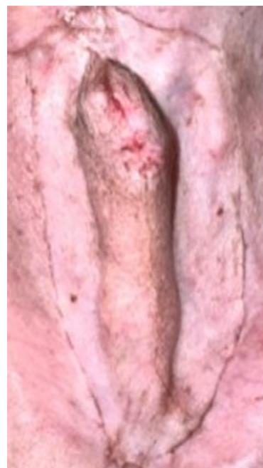
FIG 4. (Dog 5) The surgical wound was completely healed 1 month after surgery and oedema was resolved. No paraphimosis was observed

(Papazoglou, 2001). Failure of the preputial muscles to keep the prepuce in its advanced position was the likely cause of the recurrences seen in this study. The use of polyglactin 901 suture